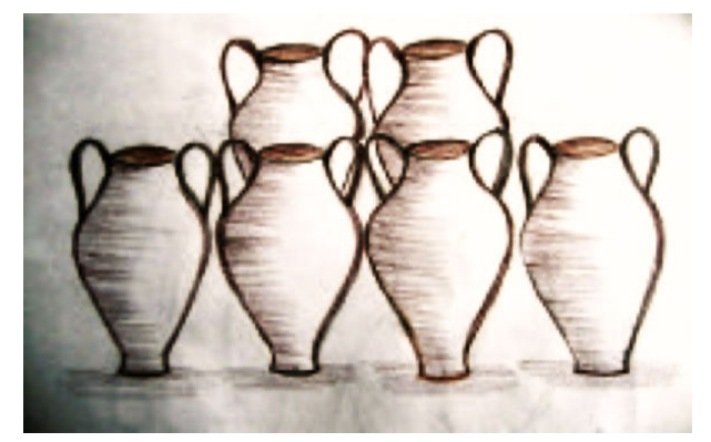
«There were six stone water jars standing there» (St. John 2,6)

These six Maxims will form the content of the six following Instructions.