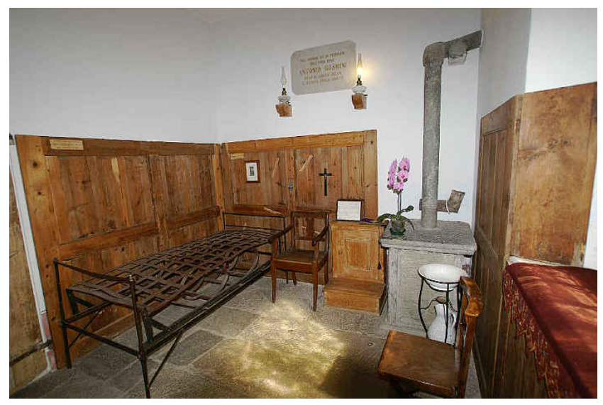
"By ourselves we are incapable of doing any good but with Christ we can do all things" (S. Monte Calvario, Blessed Rosmini's Room)

They will reflect that continual occupation is in a special manner required of those who profess to lead a perfect life, because by such profession they resolve to attend immediately, and solely, and as much as possible, to the service of God, dedicating to it their whole time and strength.