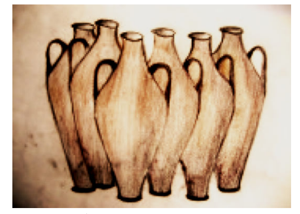
«There were six stone water jars standing there» (St. John 2,6)

«O Lord, You are my portion: I have said that I will keep Your Law» (Psalm 118,57)