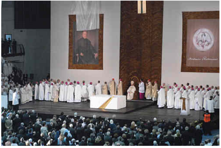
"JESUS Christ alone is the Ruler of His Church" (Beatification of Blessed Rosmini, Novara 2007)